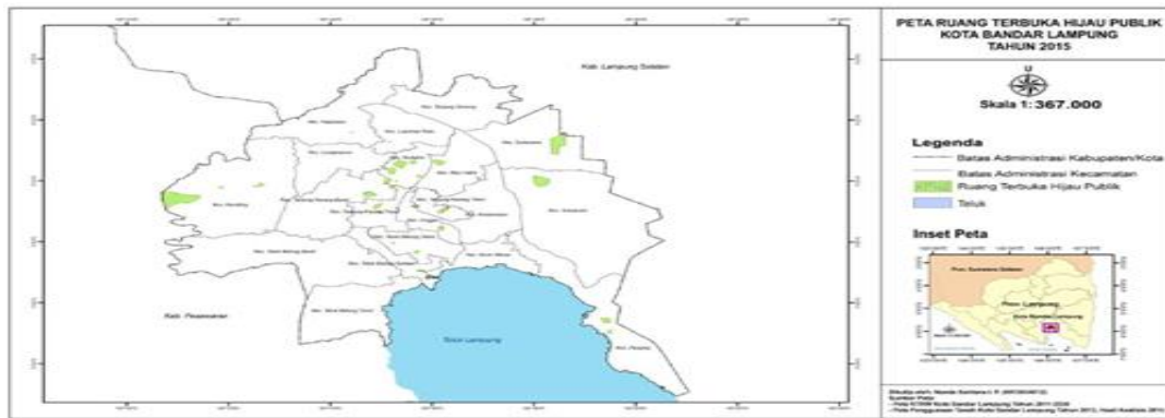
Fig. 1. 2015 City Green Open Space Map of Bandar Lampung

Bandar Lampung as the capital of Lampung province and the largest city in Lampung province as the center of government, economic center, education center and as the urban face of Lampung province has an area of 19,722 hectares with the contours of hills and coasts (BPS Bandar Lampung, 2015). From the total area, then the city of Bandar Lampung should have a Green Open Space with a total area of at least 5,916 ha consisting of Public RTH or government-owned land of at least 3,944 ha (20% of the area of Bandar Lampung city (Lailaa, 2020).