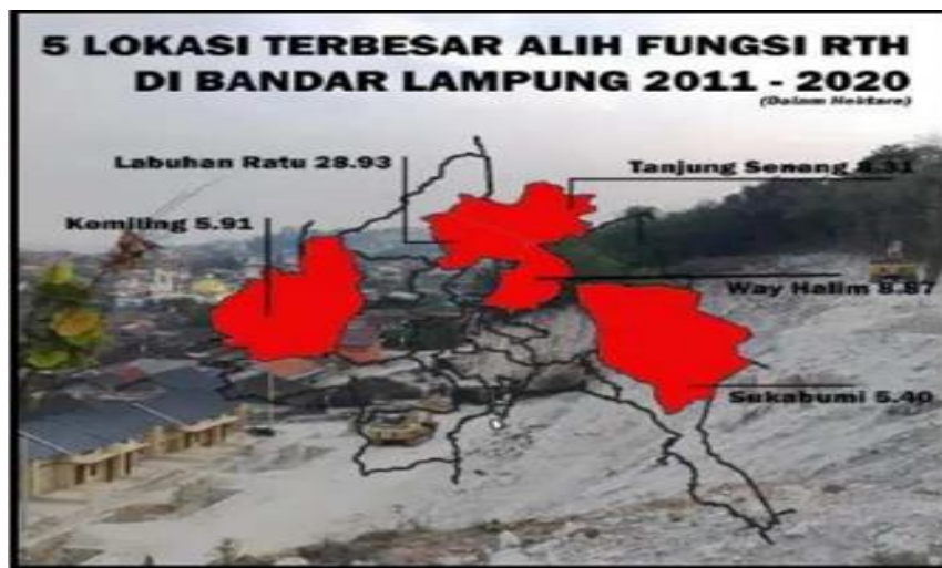
The 5 Biggest of functional shift of RTH in Bandar Lampung 2011-2020

either. The condition of the green open space of Bandar Lampung city which was 344,256 has switched functions and only 241.82 hectares remain due to land transfer. WALHI identified 5 green open spaces that experienced major changes in the following infographic: